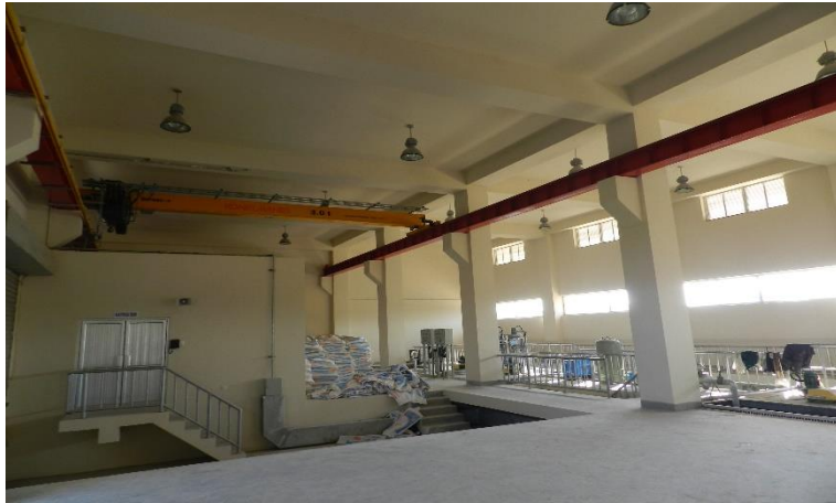
Completed Installation of 3 Tons Motorized Overhead Crane in Chemical Building, Water Treatment Plant