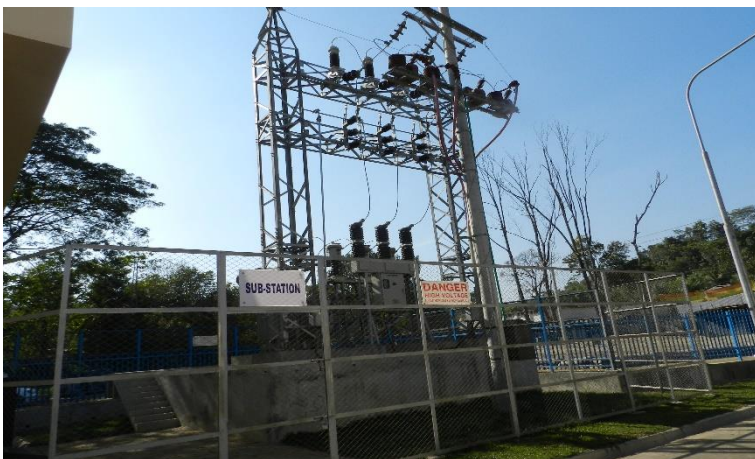
Completed Installation of 33KV/3.3KV Sub-Station at Intake Site