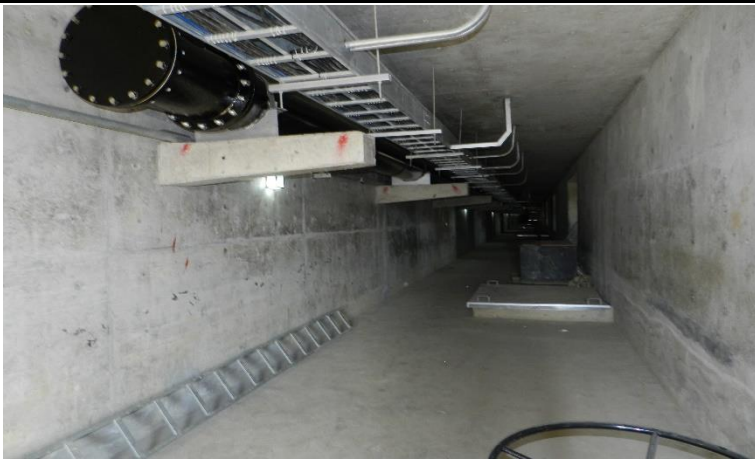
Completed Installation of Surface Wash Pipe and Cables at Cable Tray in Filter at Water Treatment Plant