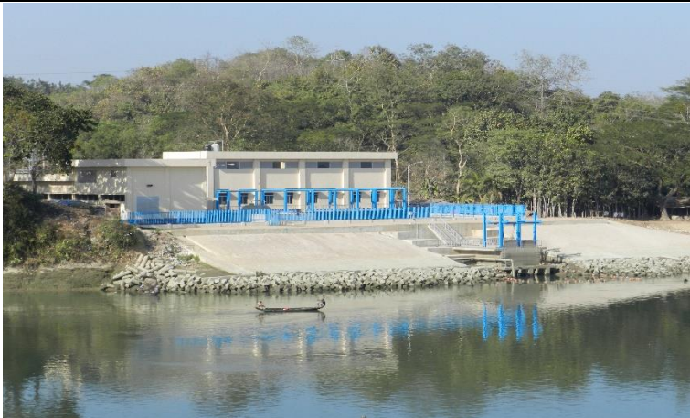
Completed Intake Facility with 150 Million Liter per Day at the Intake Site