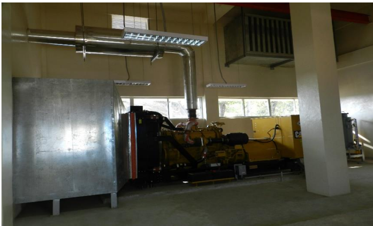
Completed Installation of 1000KVA Caterpillar Standby Generator in Generator Room at Electrical Building