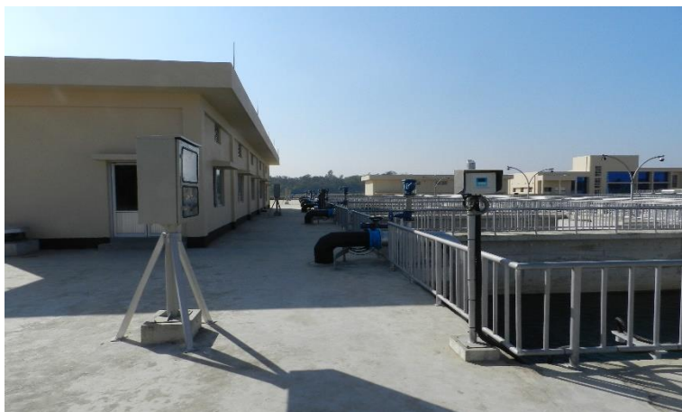
Completed Installation of Local Operation Panels and Level Meter in Filter at Water Treatment Plant