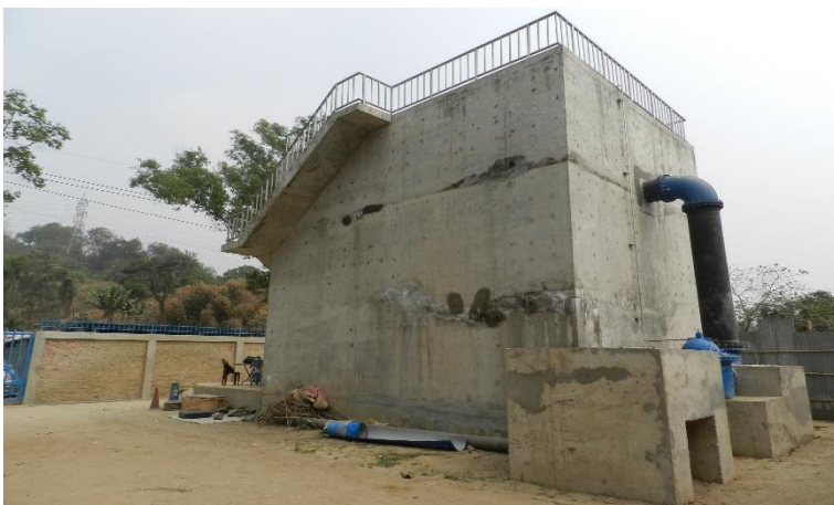
Completed Installation of Valve and Pipe Fittings at Surge Tank2