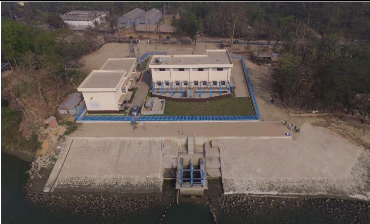
Panoramic View of Completed Intake Facility with 150 Million Liter per Day