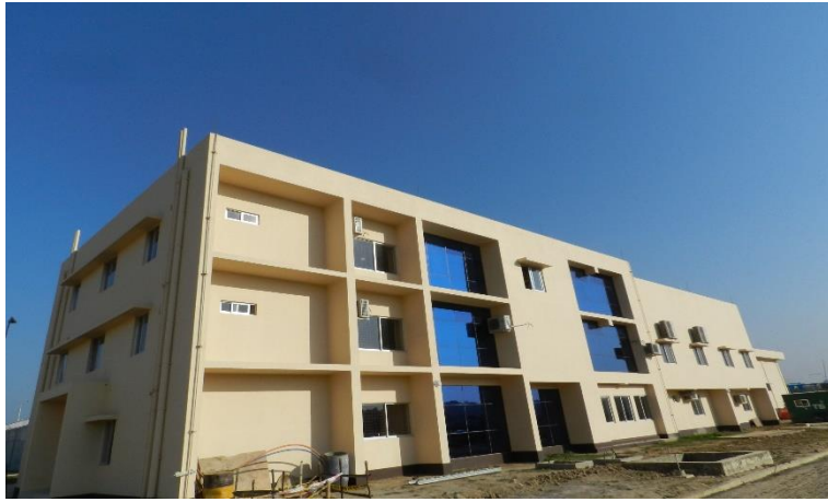
Rear View of Completed Administration Building at Water Treatment Plant