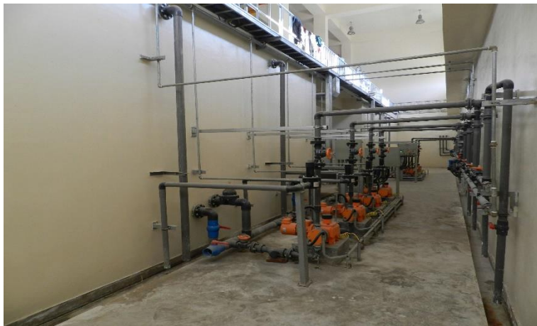
Completed Installation of Lime and Alum Dosing Pumps including necessary Pipes and Fittings in Chemical Building Water Treatment Plant