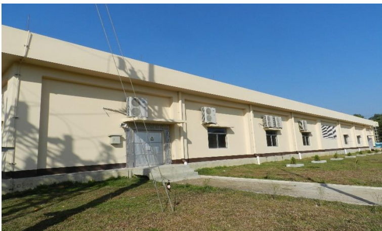
Completed Pump Control Room, Ventilation Room in Pump House at Water Treatment Plant