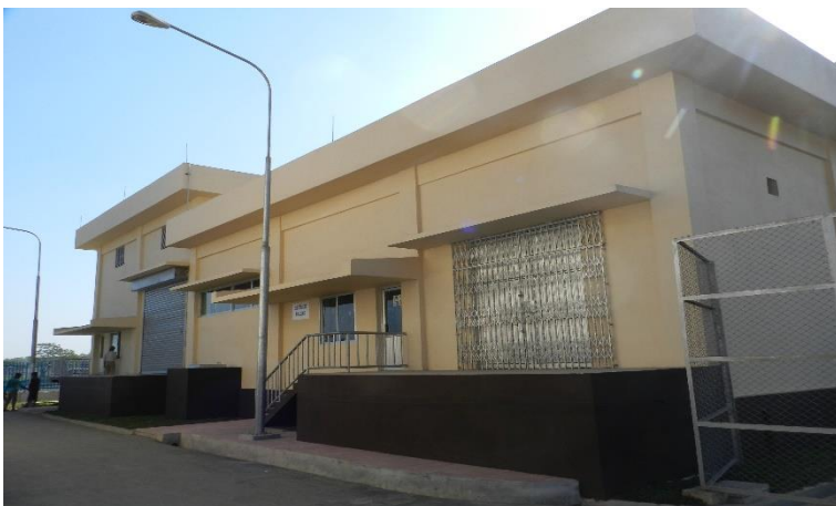
Completed Electrical Building at Intake Site