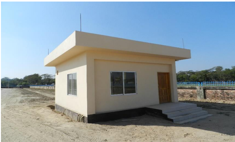
Completed Guard House at the Entrance Gate of Water Treatment Plant