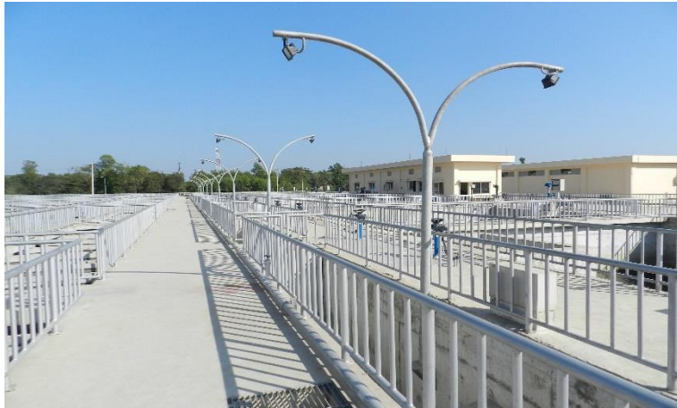
Completed Flood Light Between Filter and Clarifier at Water Treatment Plant