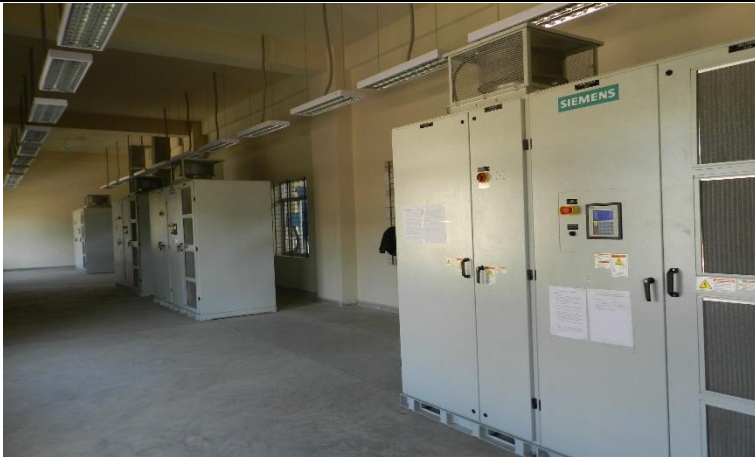
Completed Installation Pump Control Electrical Panels at Control Room at Pump Station