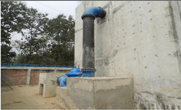
Completed Installation of Valve and Pipe Fittings at Surge Tank2