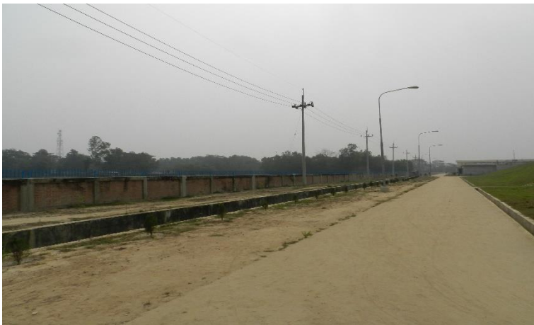
Completed Plant Road and Surrounding Fence at Water Treatment Plant