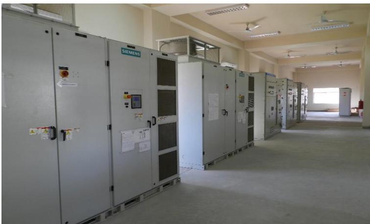
Pump Starter and PLC Panels in Pump Control Room, Pump House at Water Treatment Plant