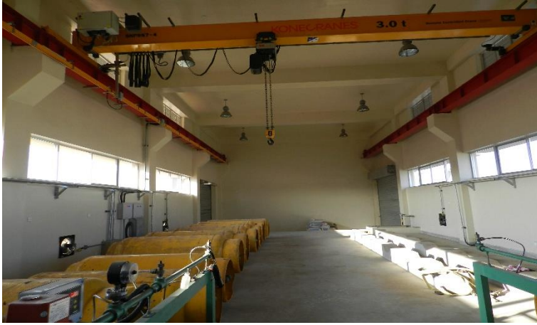
Completed Installation of 3 Tons Motorized Overhead Crane in Chlorine Building, of Water Treatment Plant