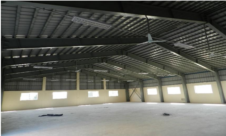
Completed Installation of H-Beam Frame with Zinc Aluminum Sheet Roofing in Warehouse at Water Treatment Plant