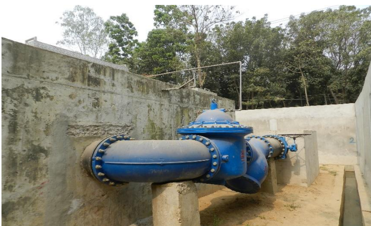
Completed Installation of Valves and Pipe Fittings in Surge Tank1