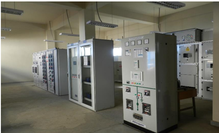
Completed Installation Electrical Panels in Electrical Building