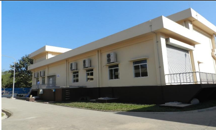
Front View of Completed Pump Station at the Intake Site