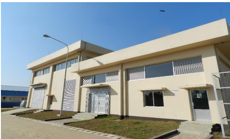
Completed Electrical Building and Generator Room at Water Treatment Plant