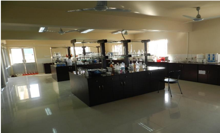
Laboratory Room with Complete Supply of Laboratory Equipment and Laboratory Furniture in Administration Building at Water Treatment Plant