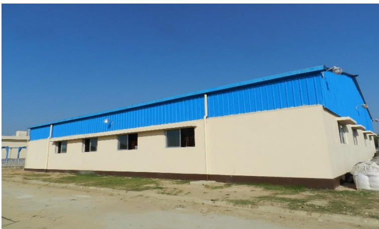
Completed Warehouse at Water Treatment Plant