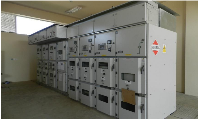
Completed Installation of MV Panels in Switchgear Room, Electrical Building