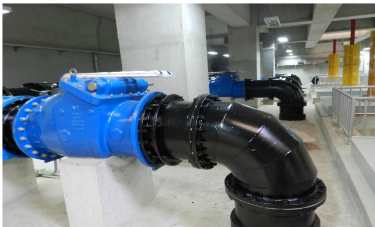
Completed Installation Transmission Pipes including Valves and Fittings at Pump Station