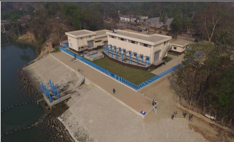
Panoramic View of Completed Intake Facility with 150 Million Liter per Day