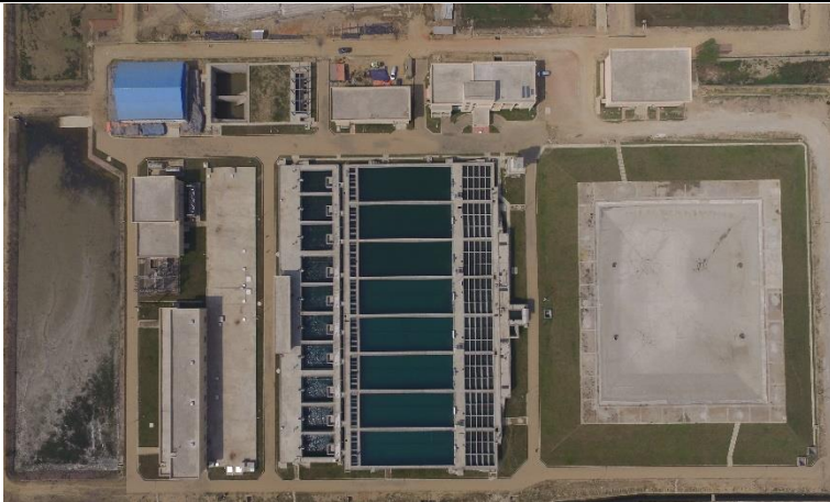
Panoramic View of Completed Water Treatment Plant with 143 Million Liter per Day