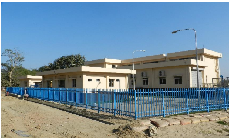
Front View of Completed Intake Facility with Perimeter Fence and Building