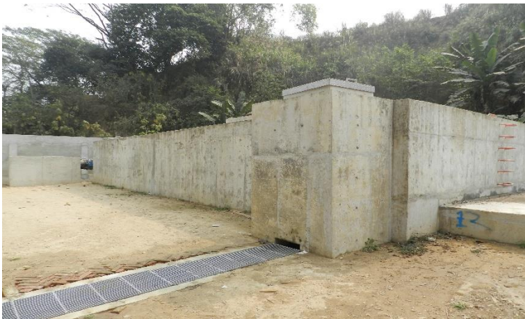
Completed Construction of Surge Tank1