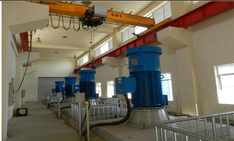
Completed Installation of Pump Motors and 5Tons Motorized Overhead Crane at Pump Station