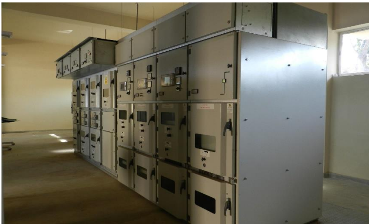
Completed Installation of Electrical Panels in Electrical Building