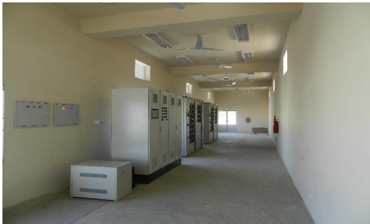
MCC and PLC Panels in Electrical Control Room at Filter