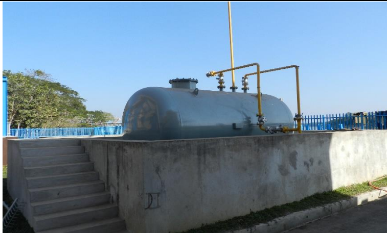
Main Fuel Tank at the Back of Electrical Building