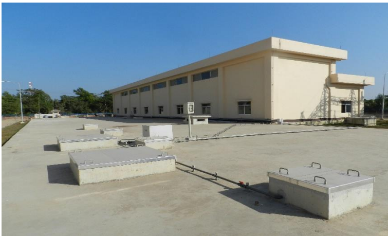
Completed Clear Well, Pump Station at Water Treatment Plant