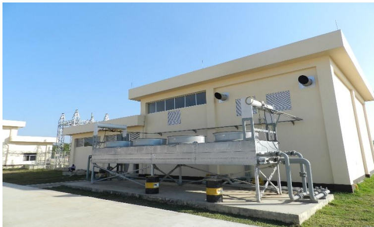
Completed Cooling System and Silencer at the Back of Electrical Building