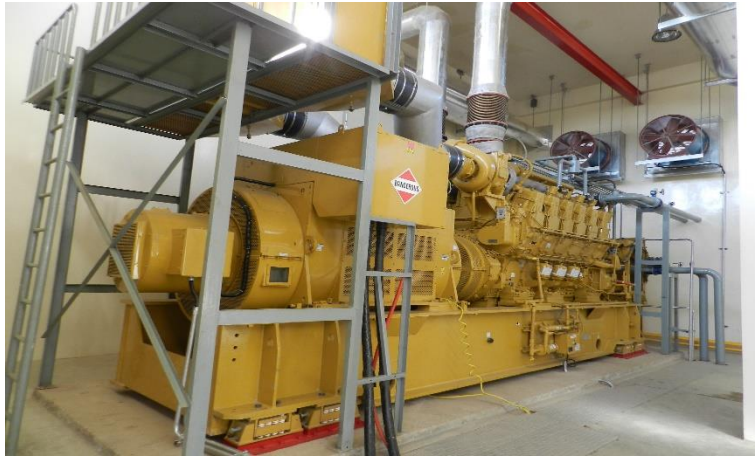
Completed Installation of 3500KVA Caterpillar Standby Generator in Generator Room, Electrical Building