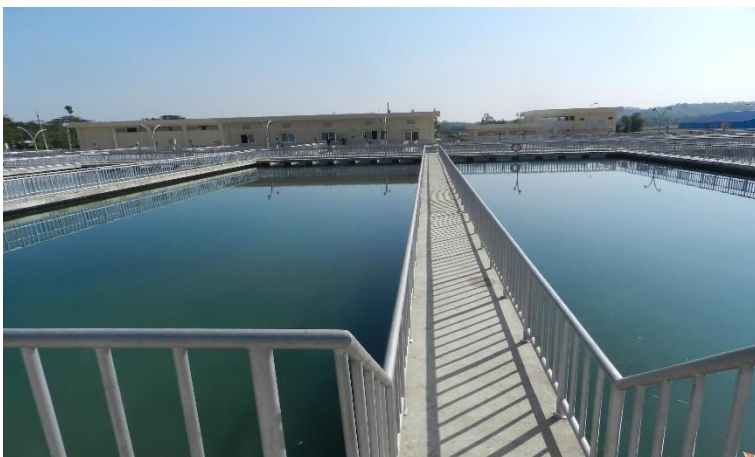
Completed Water Channel in Clarifier at Water Treatment Plant