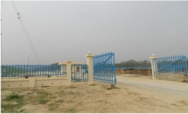
Completed Main Entrance Gate at Water Treatment Plant