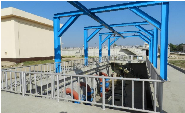
Completed Installation of Steel Frame with Mechanical Hoist Crane, Drain Pumps, Handrails in Filter Drain Tank of Water Treatment Plant