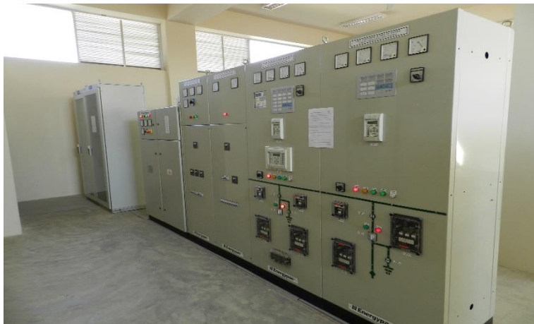
Completed Installation of Generator Control Panels in Switch Gear Room, Electrical Building