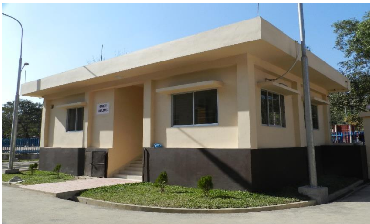
Front View of Completed Office Building at Intake Site