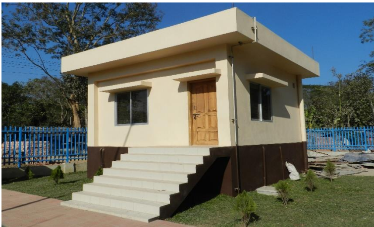
Completed Guard House at Intake Site