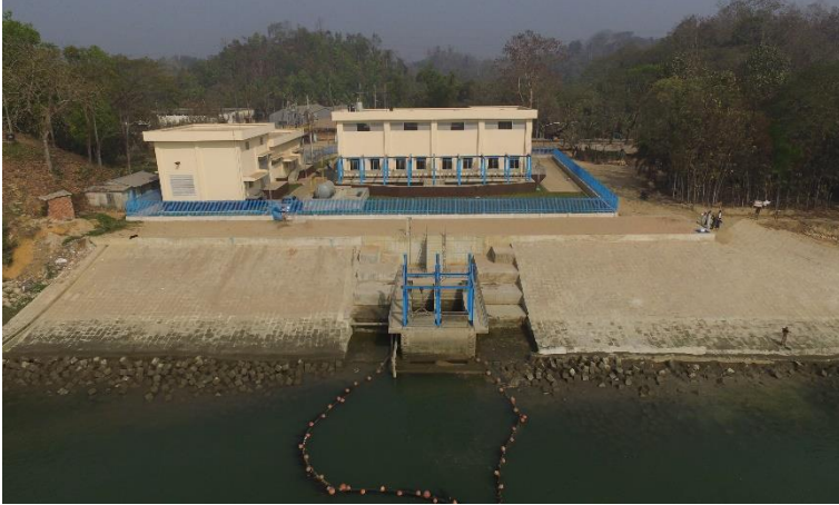
Panoramic View of Completed Intake Facility with 150 Million Liter per Day