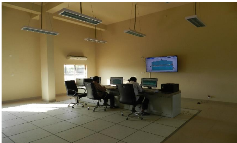
Completed Installation of SCADA System in Administration Building Control Room Water Treatment Plant