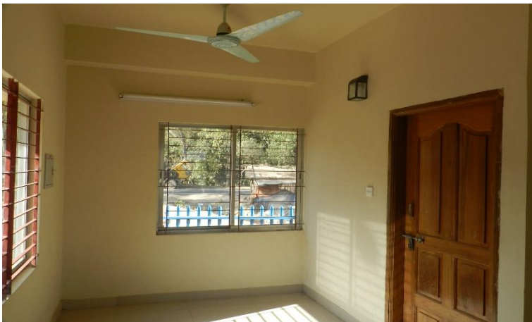
Inside Guard House