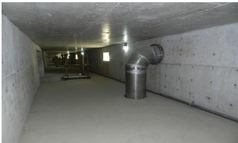
Completed Air Release Pipe in Filter at Water Treatment Plant