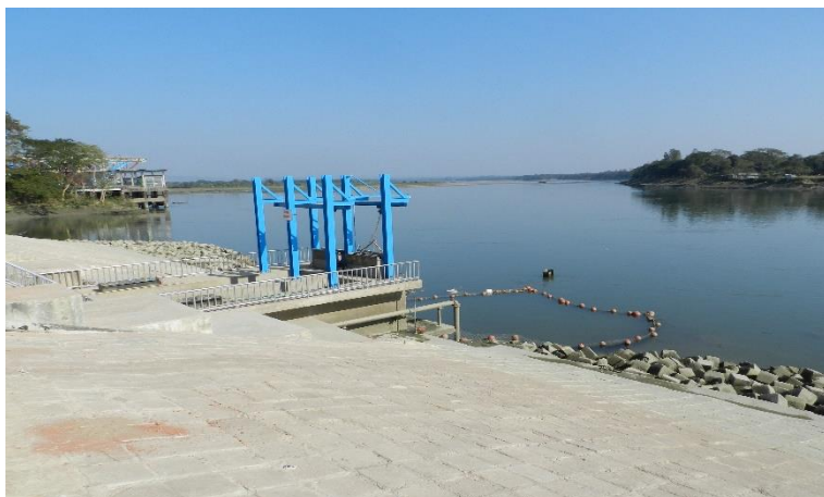
Completed Inlet Channel including Floating Fence