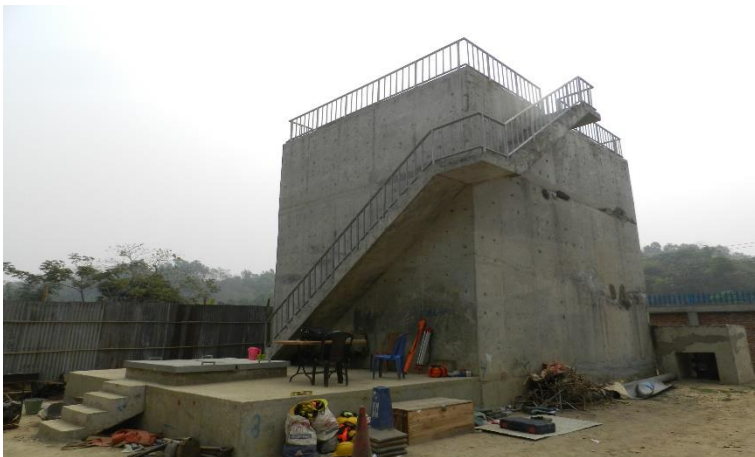
Completed Construction of Surge Tank2