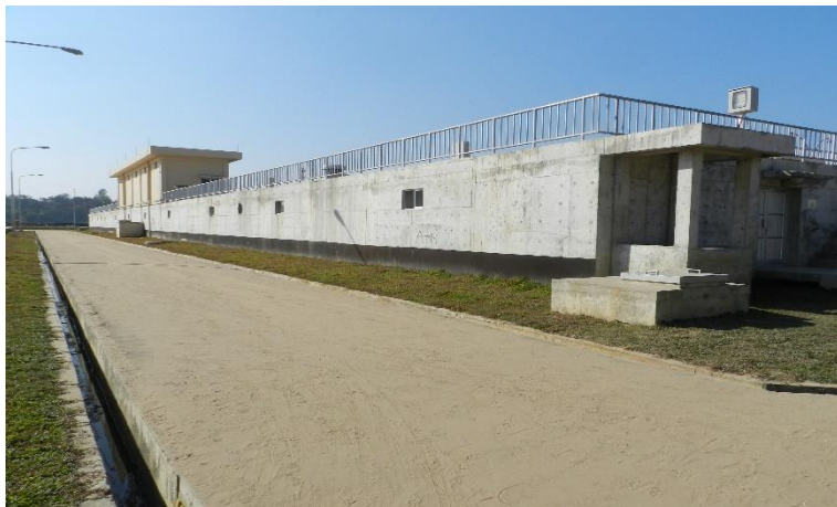
Completed Filter and Electrical Control Panel Room at Water Treatment Plant