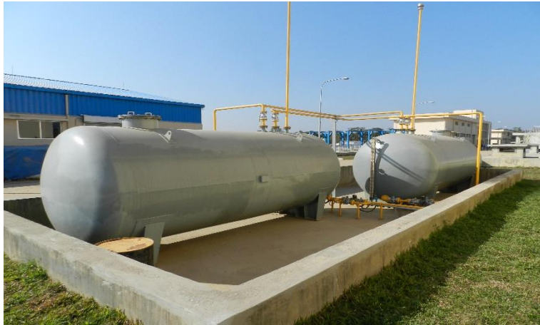
Complete Installation of Main Fuel Tank Beside Electrical Building