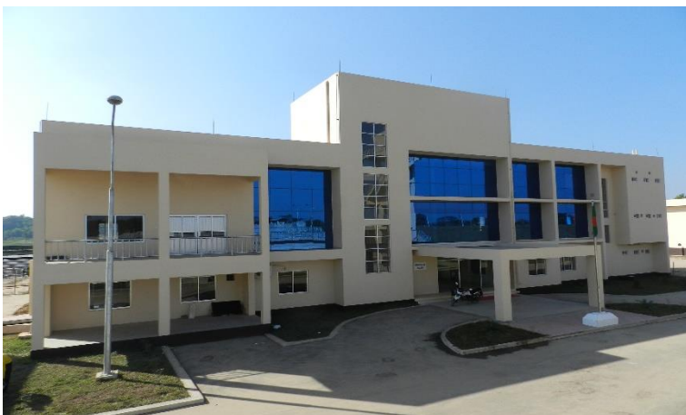
Front View of Completed Administration Building at Water Treatment Plant