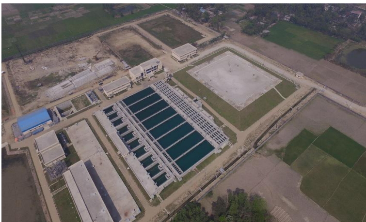
Panoramic View of Completed Water Treatment Plant with 143 Million Liter per Day