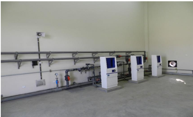
Completed Installation of Chlorinator including Piped and Fittings in Chlorine Building Water Treatment Plant