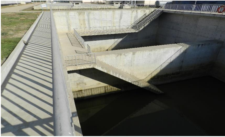
Completed Filter Drain Tank at Water Treatment Plant