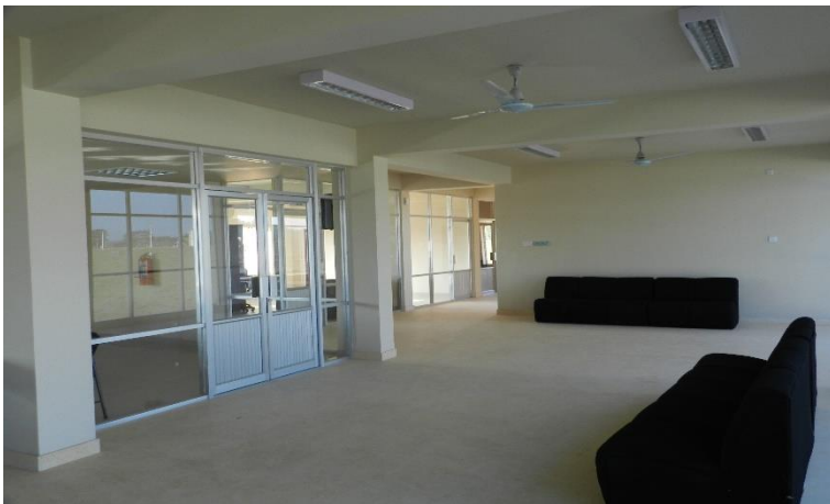
Delivered Furniture, Aluminum Partition at Display Area of Administration Building at Water Treatment Plant