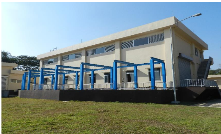
Rear View of Completed Pump Station at the Intake Site