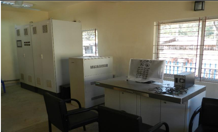
PLC Panels and PMS at the Office Building at Intake Site