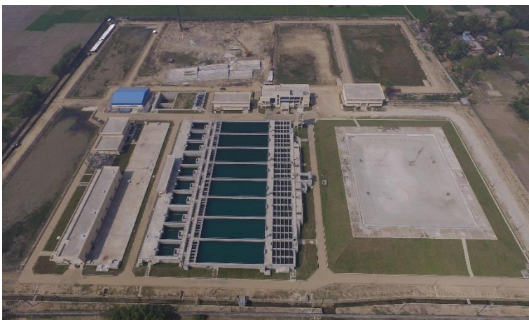
Panoramic View of Completed Water Treatment Plant with 143 Million Liter per Day