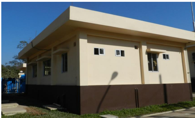
Rear View of Completed of Office Building at Intake Site