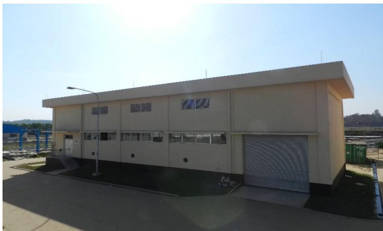
Front View of Chlorine Building at Water Treatment Plant