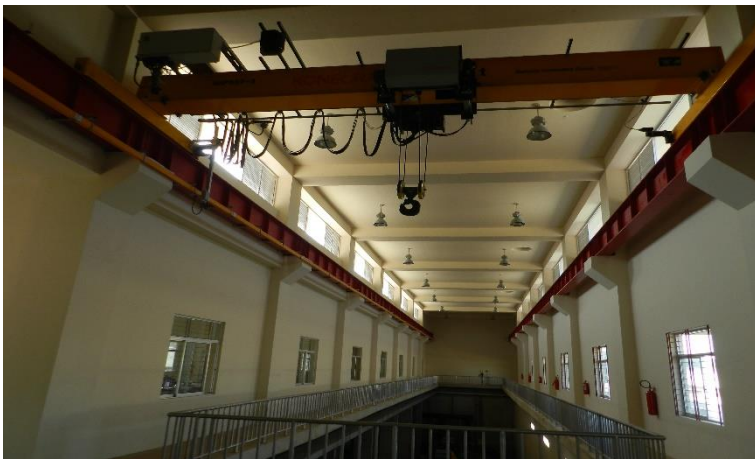
Completed Installation of 5 Tons Motorized Overhead Crane in Pump Station at Water Treatment Plant