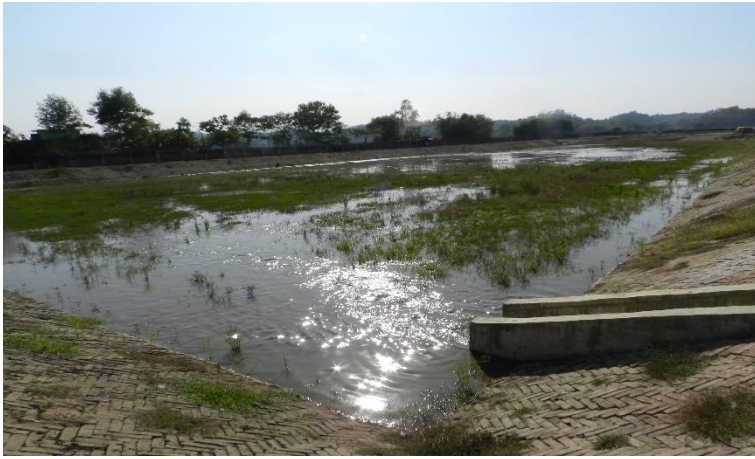
Completed Outlet Pipe in Sludge Lagoon "A" Water Treatment Plant