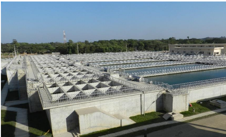
Completed Receiving Well, Flocculator, Clarifier at Water Treatment Plant