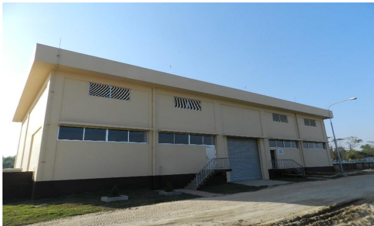
Front View of Chemical Building at Water Treatment Plant