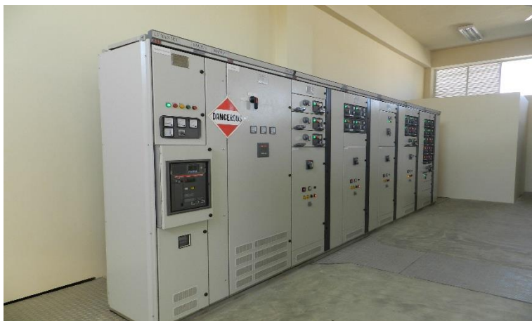
Completed Installation of LV Main MCC Panels in Switchgear Room, Electrical Building