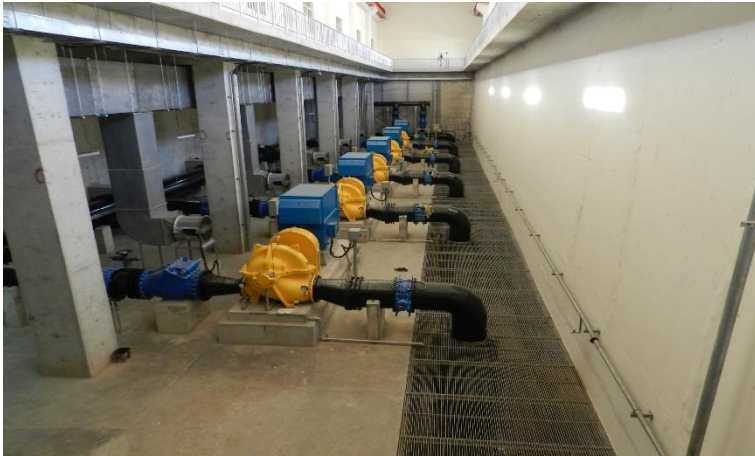
Completed Installation of 5Nos. Transmission Pumps including Transmission Pipes at Water Treatment Plant