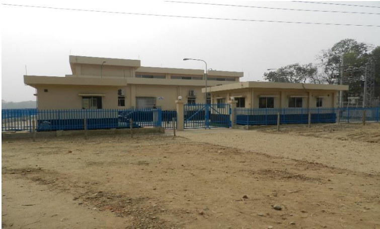
Completed Fence and Gate at Intake Site