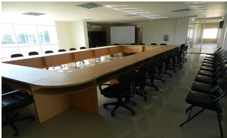
Delivered Office Furniture in Administration Conference Room Water Treatment Plant