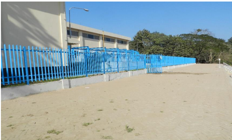
Rear View of Completed Intake Facility with Perimeter Fencing and Building