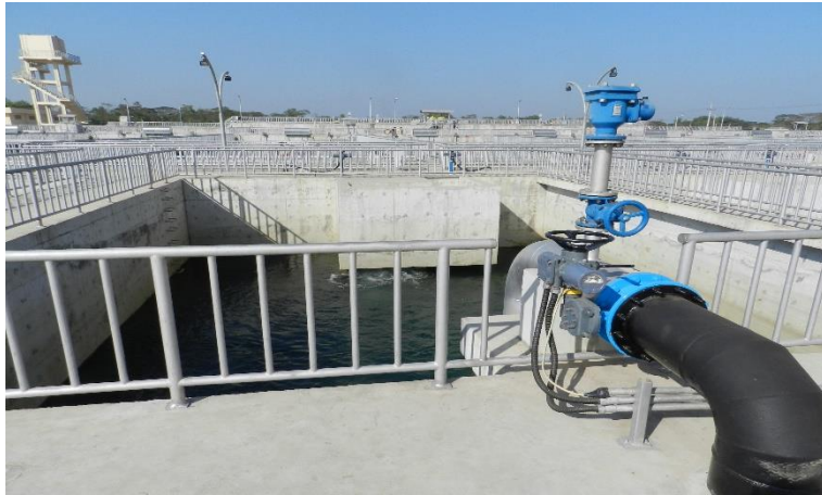
Completed Surface Wash Pipe in Filter at Water Treatment Plant