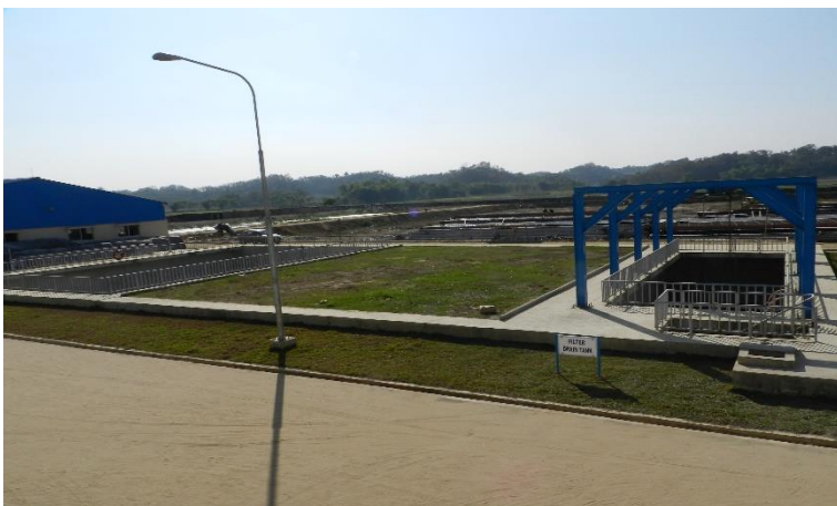
Panoramic View of Filter Drain Tank at Water Treatment Plant