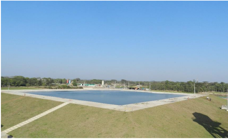
Completed Pre-Sedimentation Basin at Water Treatment Plant