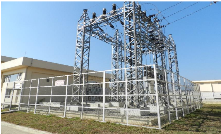
Completed 33KV/3.3KV Sub-Station at Water Treatment Plant