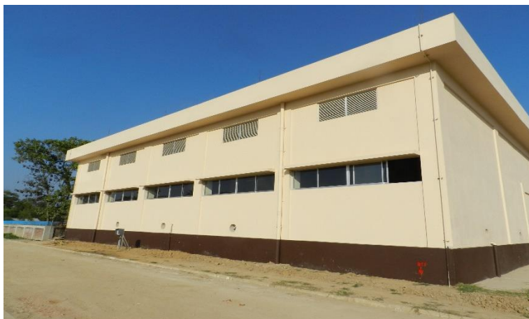
Rear View of Chemical Building at Water Treatment Plant