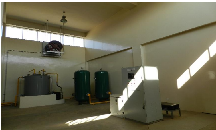
Daily Fuel Tank and Air Tank in Generator Room Inside Electrical Building